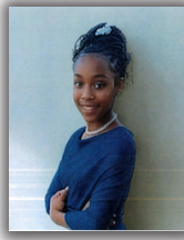
Bernard Malkove Club